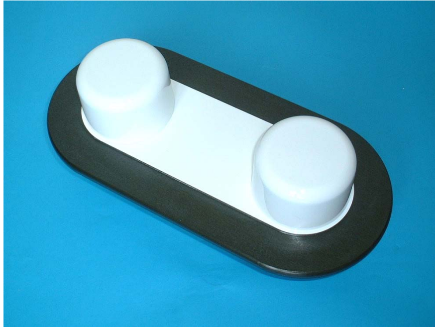
Figure 1. AD520-10 Active Iridium antenna