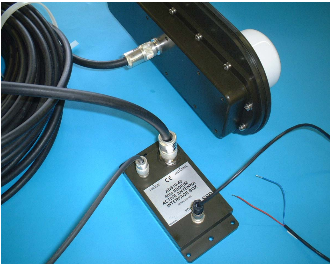
Figure 3. AD520-40 voltage regulator and break-in for use with +9 to 36Vdc supply. The case is hard anodised aluminium and has fixing flanges. A 40m coil of RG213U cable is shown connected to an AD520-10 active antenna (top). The handset interconnect is shown trailing from the TNC to the bottom left, whilst the flying lead for connection to 9 to 36V dc supply is shown cutting the frame to the right.